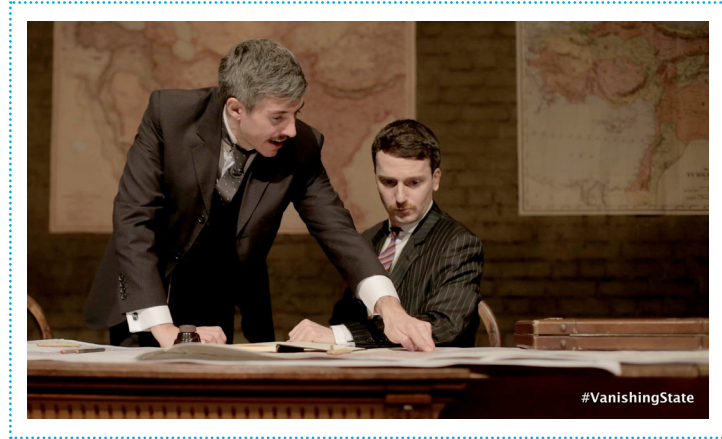
Lucien Bourjeily, 'Vanishing State'