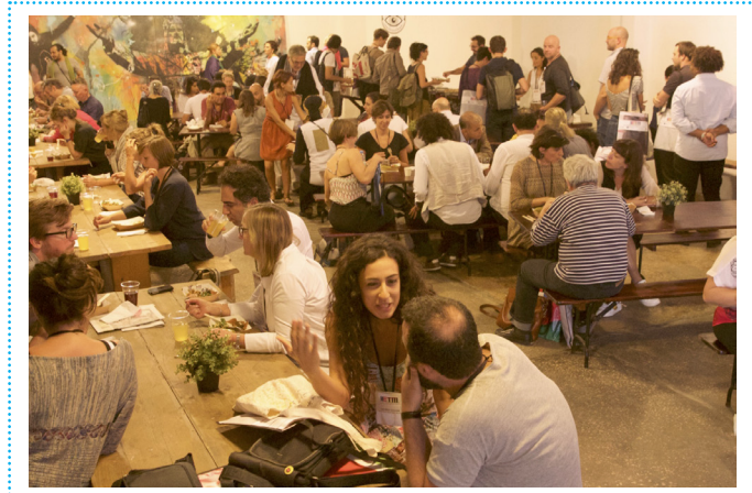
IETM Satellite meeting in Beirut, October 2016