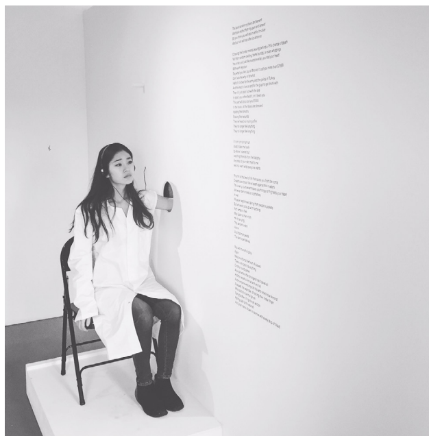
Tania el-Khoury, As Far As My Fingertips Take Me

After highlighting that freedom of expression and access to the public space are guaranteed by the fundamental law in Lebanon, the report specifies the rules to respect in order to get permission for creative work in the public space. First of all, one has to respect the decree of 1974 about cleanliness in public space; then article 209 of the Penal Code about the means of diffusion in public space, avoiding defamation, vituperation and degradation, condemned by the Penal Code.